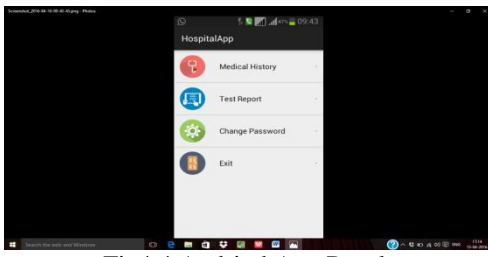
Fig4.4 Andriod App Panel