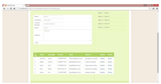
Fig4.2 Hospital Panel(Doctor)