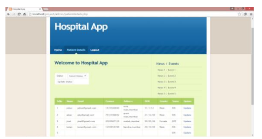
Fig 4.1 Admin Panel