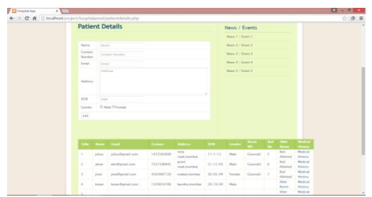
Fig 4.2 Hospital Panel(patient)