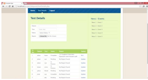
Fig4.3 Lab Panel